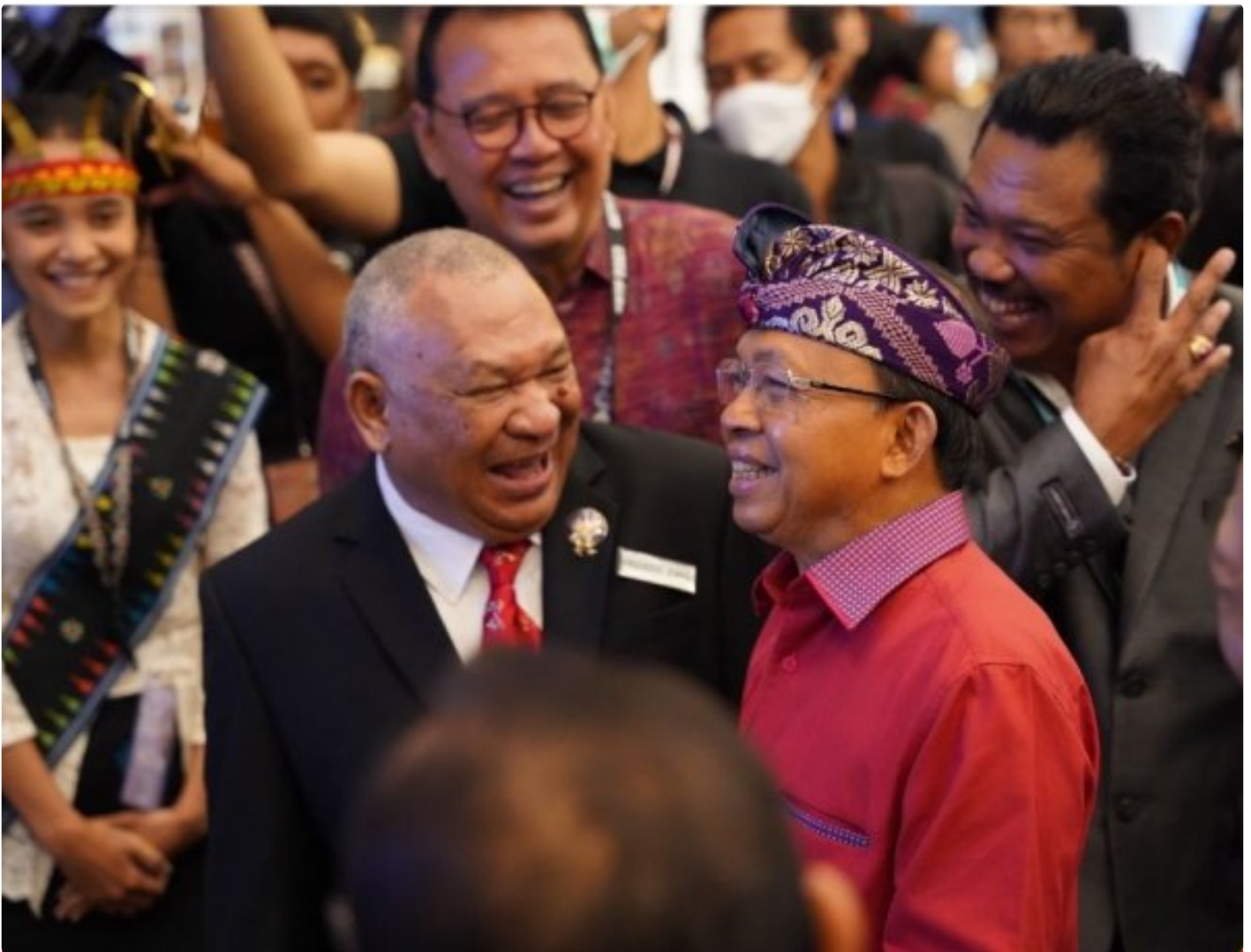
Bali & Beyond Travel Fair 2023.

BALI - The 9th Bali and Beyond Travel Fair (BBTF) TRAVEX was officially inaugurated by the Governor of Bali, Wayan Koster who has a deep concern for the tourism Industry, accompanied by the representative of the ministries, local